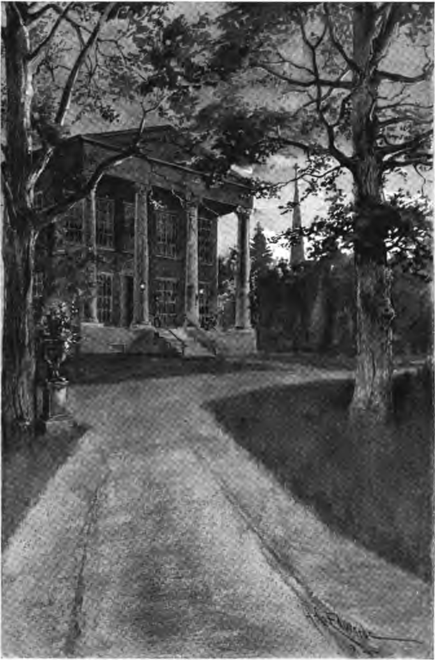
"A GRAND OLD MANSION ON A CITY ROAD."